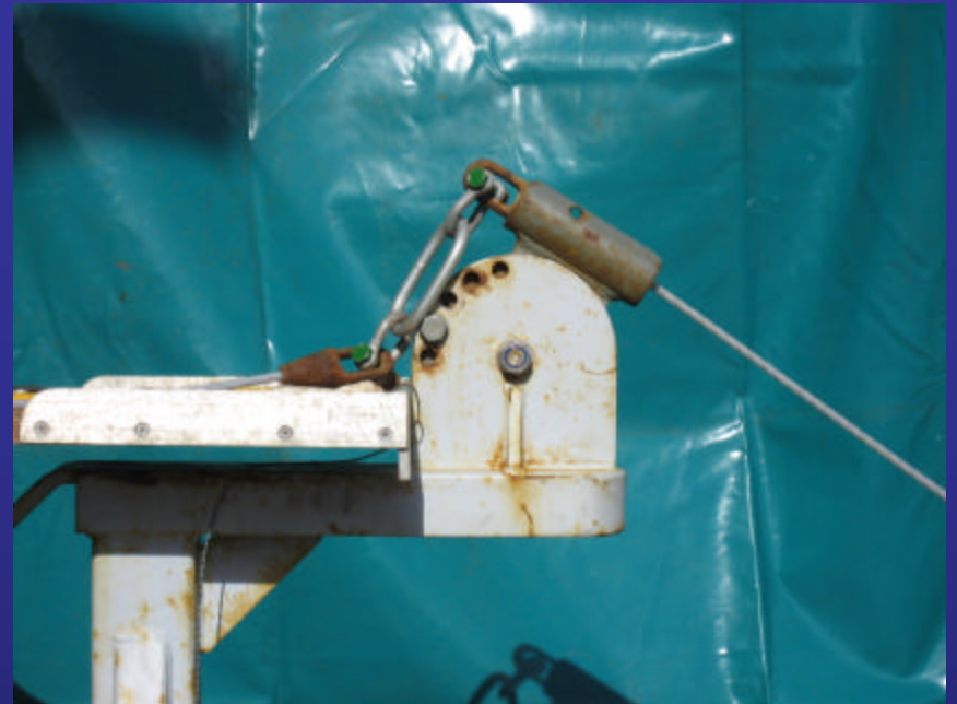
Cable Stopper in different angles