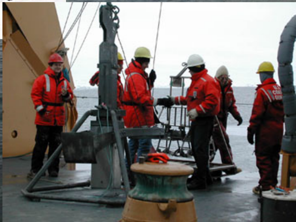
Whaling photos courtesy of Craig George. SBI photos courtesy of Dave Forcucci.