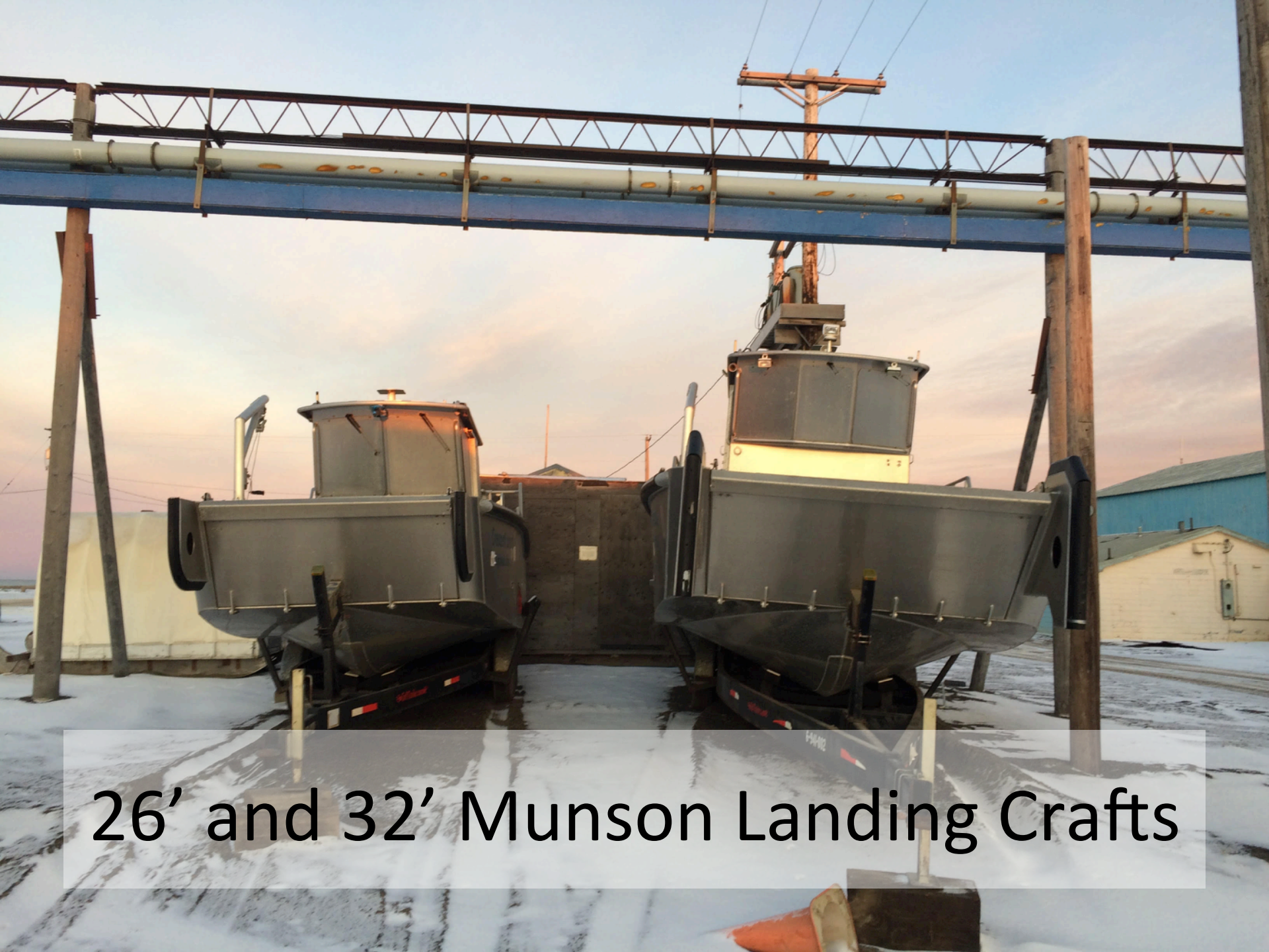
26' and 32' Munson Landing Crafts