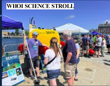
WHOI SCIENCE STROLL