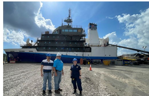
NOAA Ship Oceanographer, %% Complete with a delivery date of Spring 2026