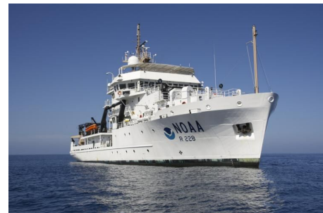
NOAA Ship Reuben Lasker first vessel in NOAA fleet to comply with the Safer Seas Act