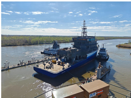
NOAA Ship Discoverer Launched in Houma, LA March 12th, 2025