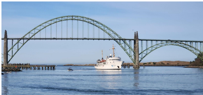
NOAA Ship Rainier returned to homepor for the first time in over 2 years!