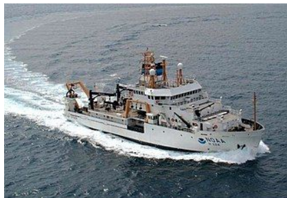
NOAA Ship Oscar Dyson first FSV planned to go into Midlife Repair Period in 2026