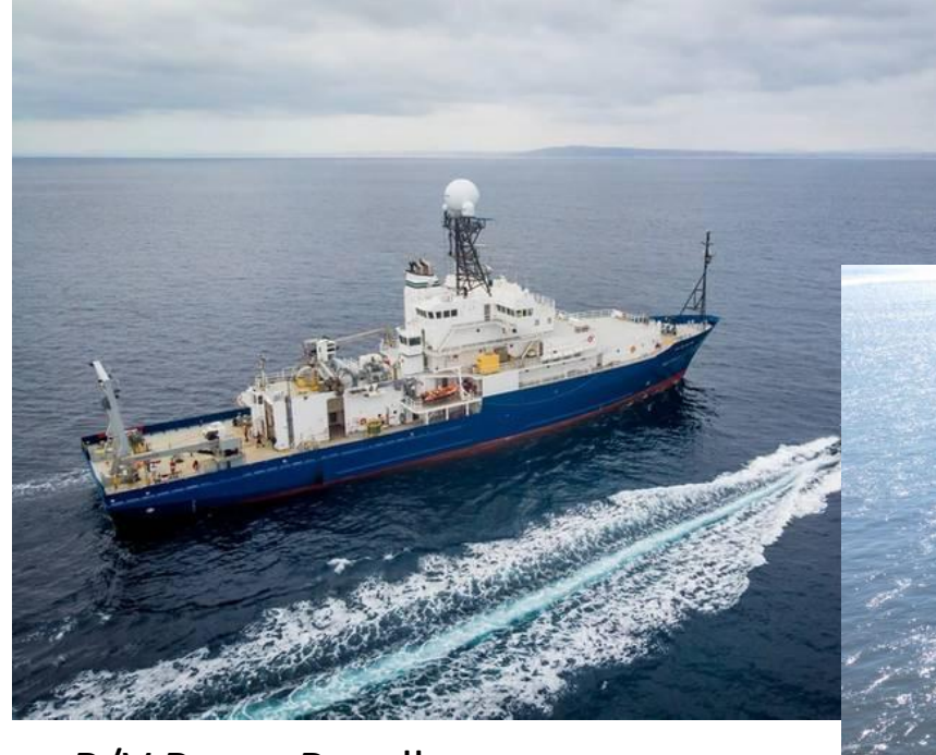
R/V Roger Revelle