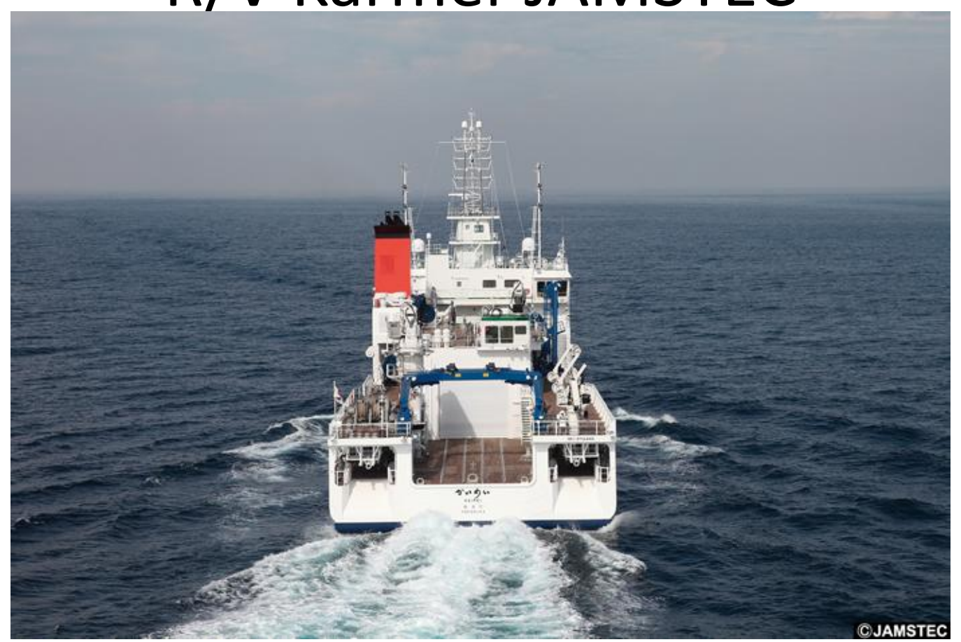
JAMSTEC's R/V Karmei – 100m vessel with 2D/3D seismic capabilities, coring, ROV support, 65 berths, 2016 build.