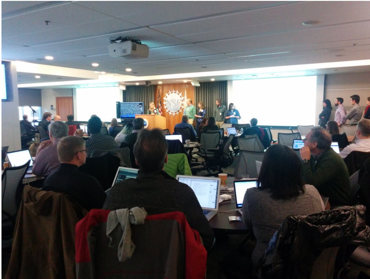
UNOLS OOI Coastal Arrays Workshop – January 2016