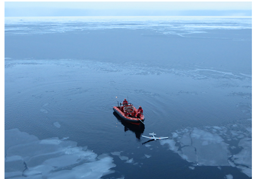
Recovery of PUMA UAS