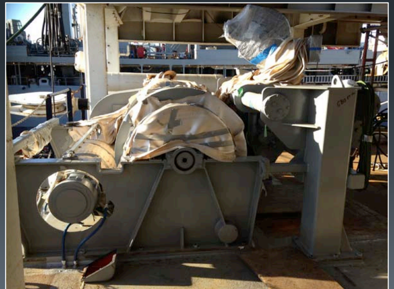
R/V Marcus Langseth