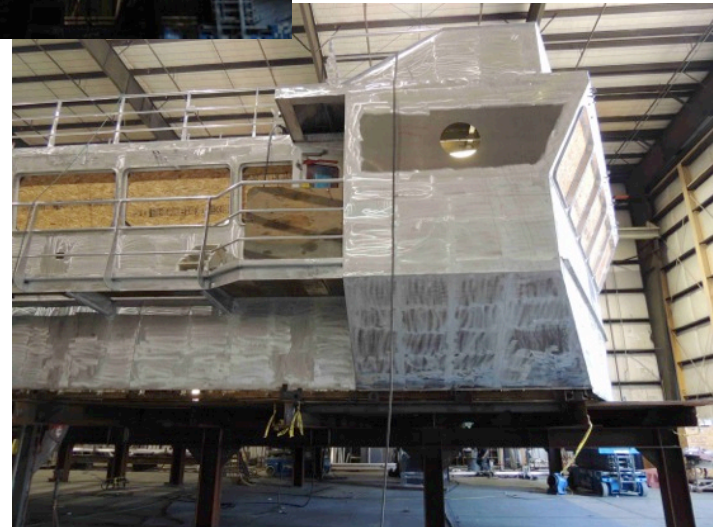
R/V Neil Armstrong Aluminum Pilot House