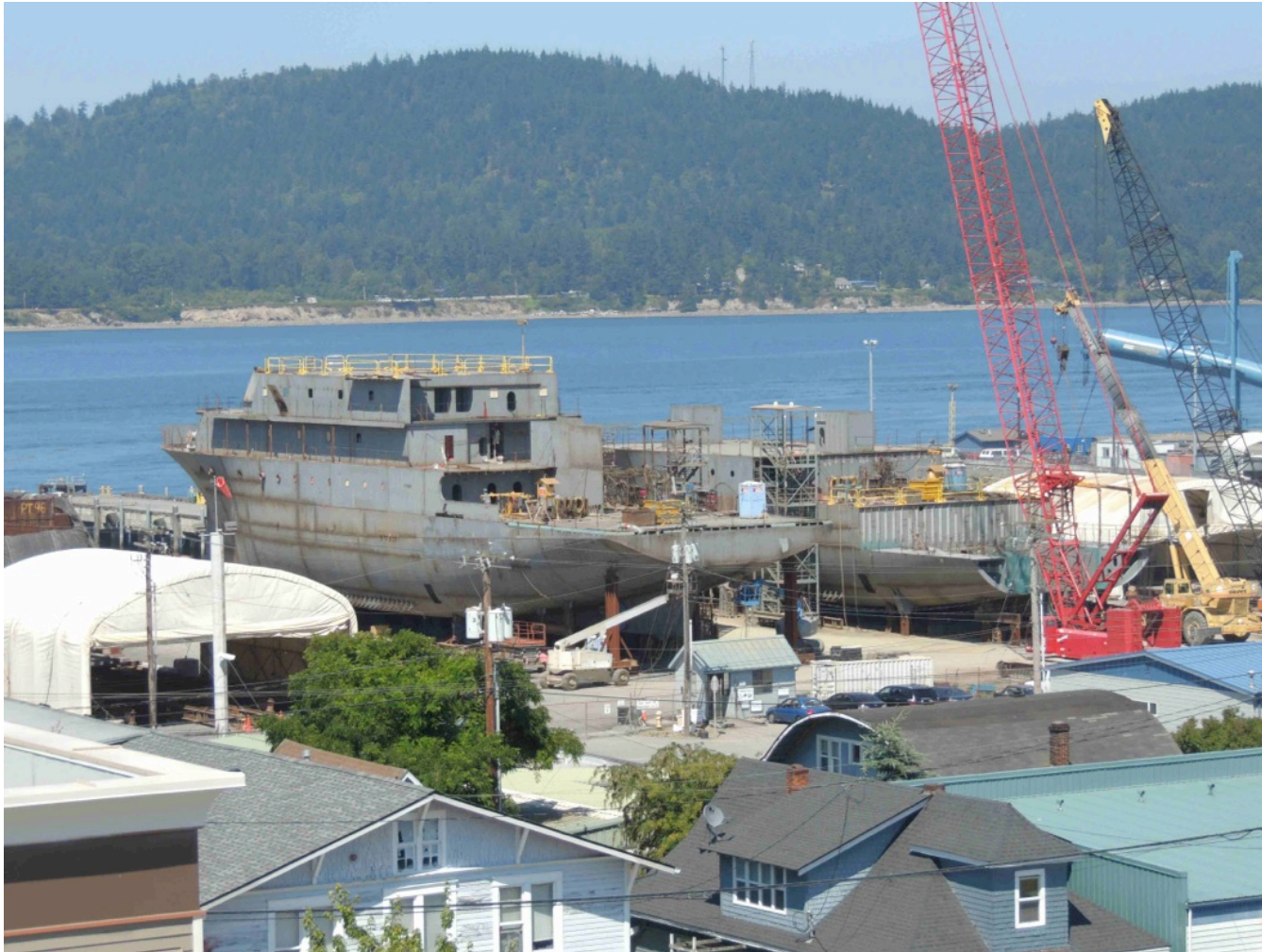
Another Beautiful Day in Anacortes at Dakota Creek Industries Shipyard.