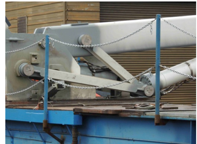
Factory Acceptance Test @ Allied for Neil Armstrong Stern Frame.