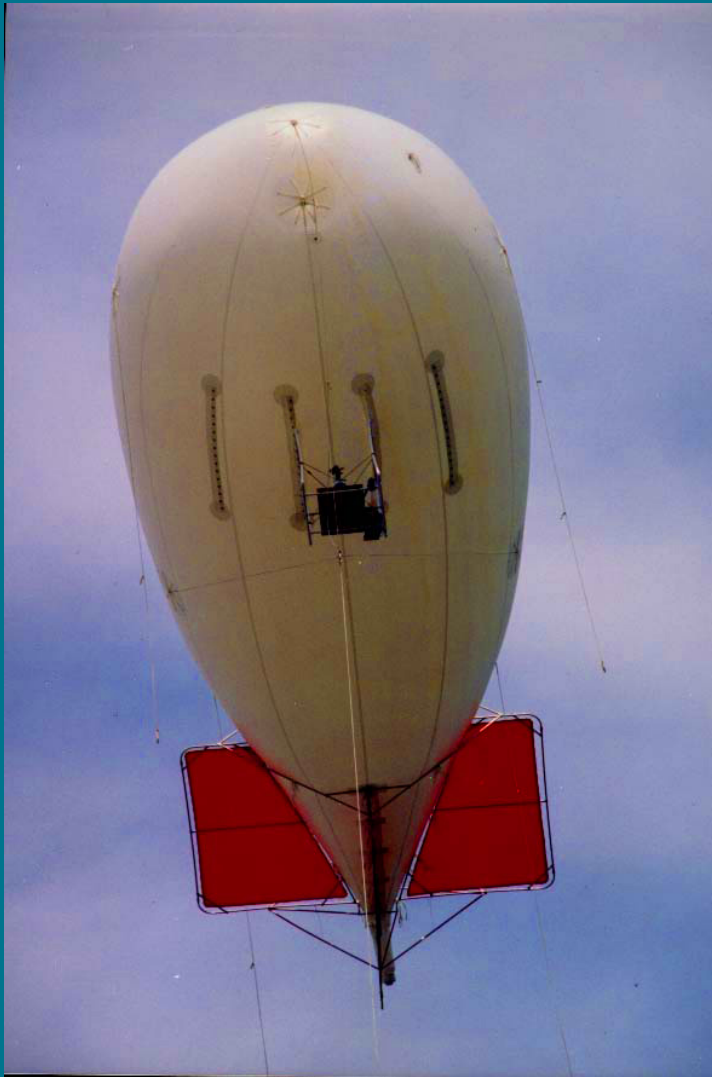
30 ' aerostat