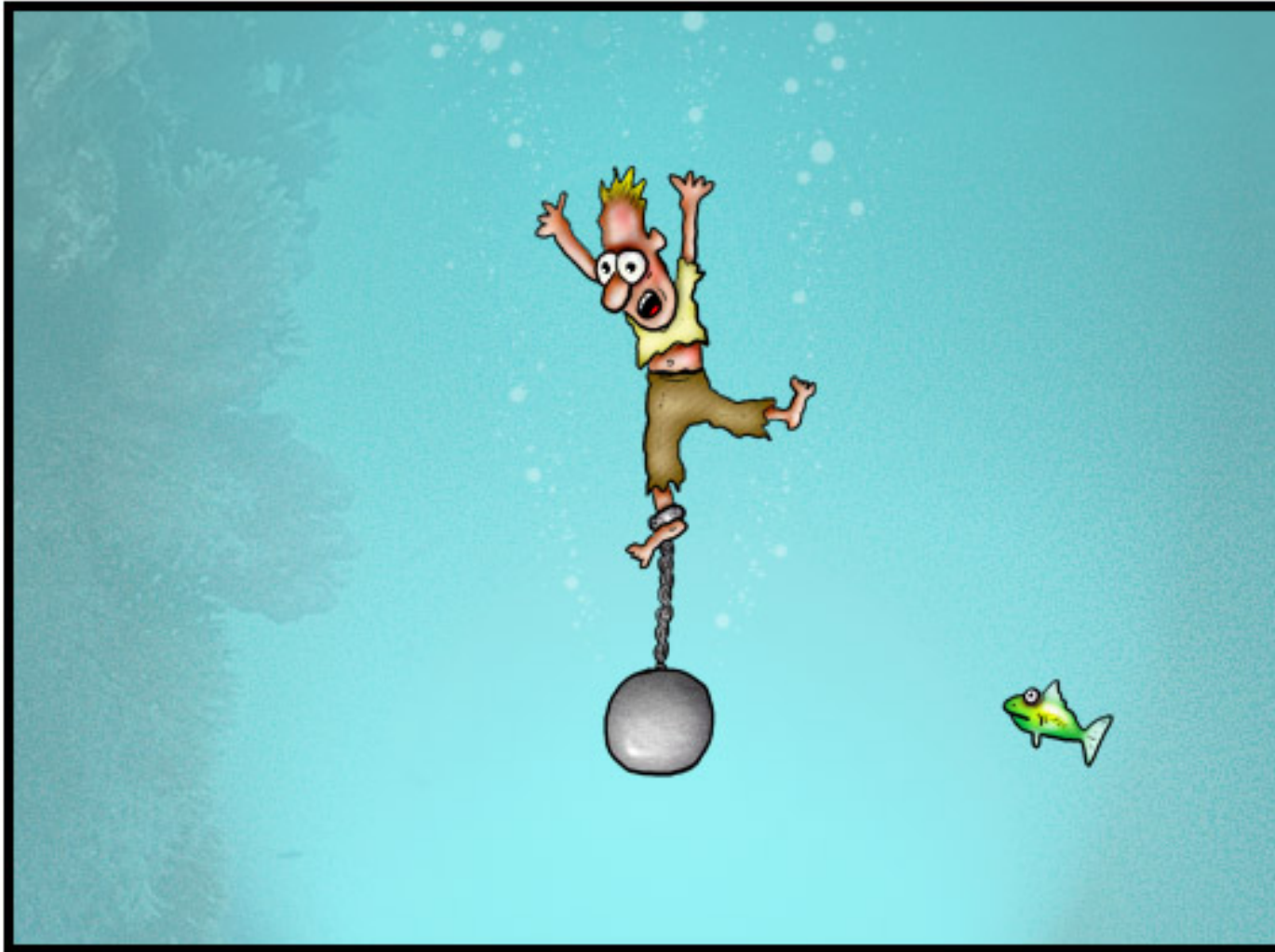
Early experiments in deep-sea exploration