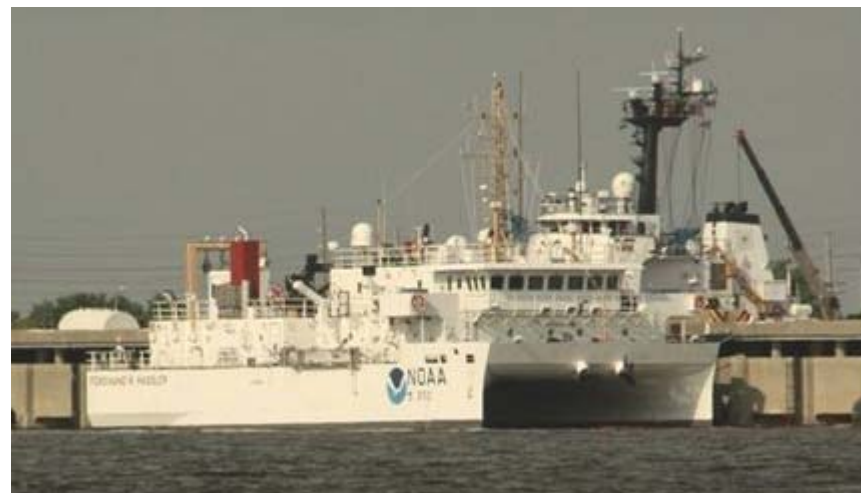
Ferdinand R. Hassler