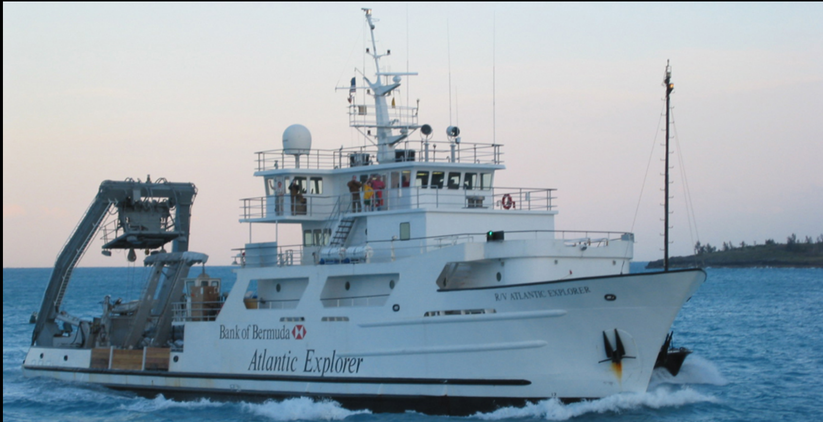
R/V Atlantic Explorer, Bermuda Institute of Ocean Sciences.