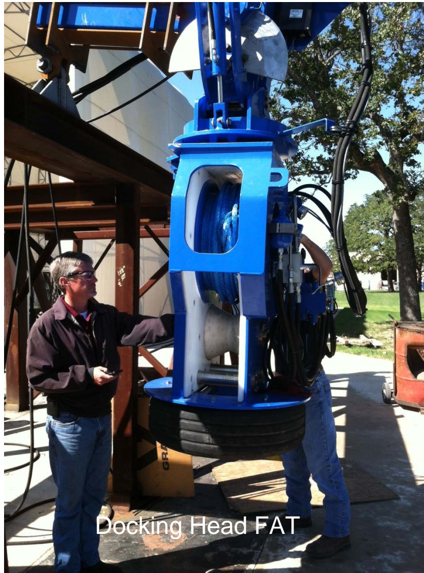
Docking Head FAT