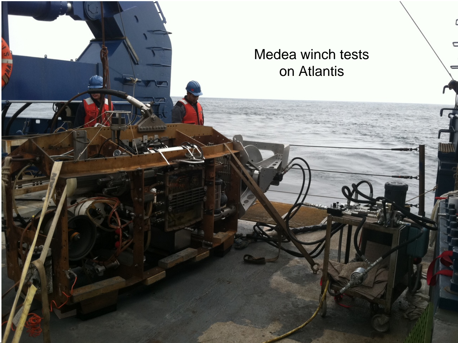
Medea winch tests on Atlantis