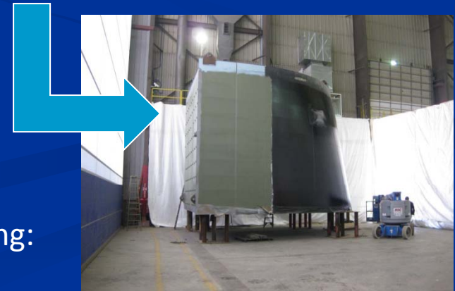
Module 833 before and after painting: