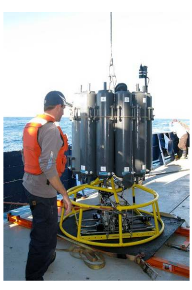
CTD Rail/Cart for R/V ROGER REVELLE