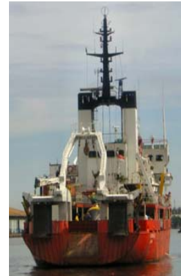
Baruna Jaya IV