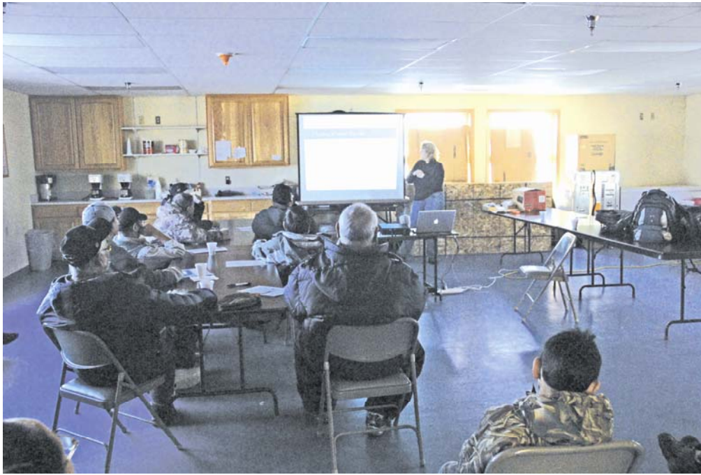
25 residents of Savoonga Alaska (population ~750) listening to past scientific results and plans for March 2010 icebreaker cruise