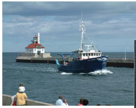
R/V Blue Heron University of Minnesota - Duluth

Any timelines, projections, estimates and/or recommendations given are current only as of the date of this report. The UNOLS Office makes no commitment and disclaims any duty to update any of the information contained in this report. This publication and any referencee to any information it contains is provided "as is" without any implied terms of any kind.