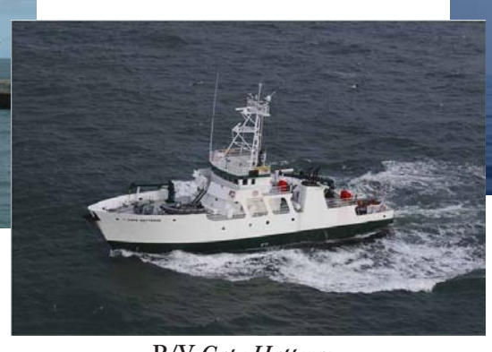
R/V Cape Hatteras Duke/University of North Carolina