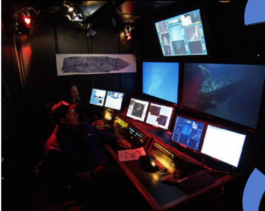
Bert Fox, National Geographic