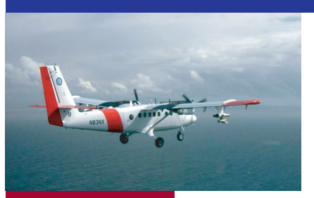
The CIRPAS Twin Otter Airplane in Flight.