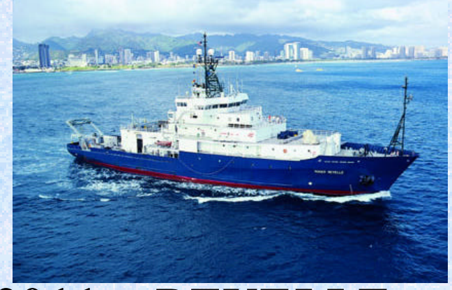
2011 - REVELLE

FIC recommends the model used for developing the Ocean & Regional Class SMRs