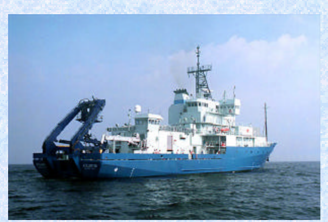
2012 - ATLANTIS

FIC recommends the model used for developing the Ocean & Regional Class SMRs