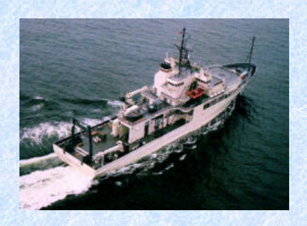
2006 - THOMPSON