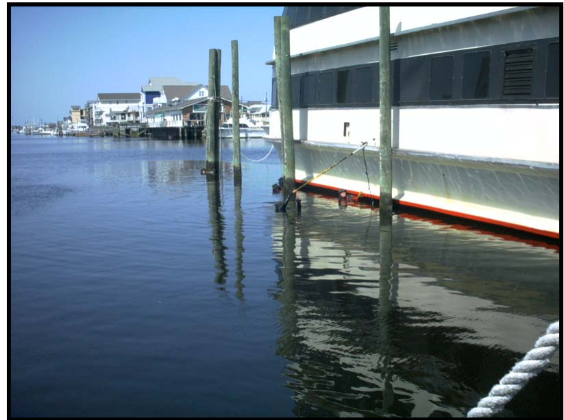
Diver inspecting ship's hull