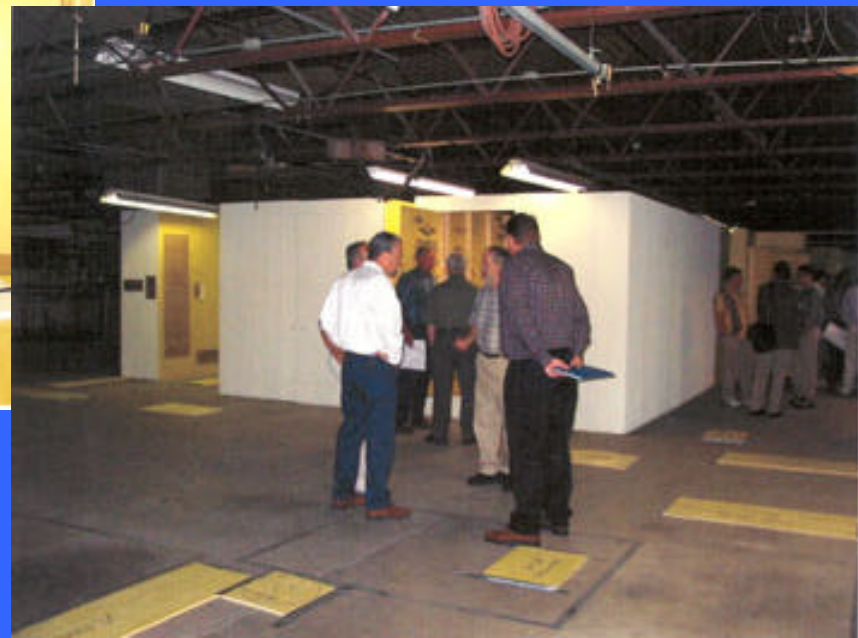
DYNACON Group on "aft deck"