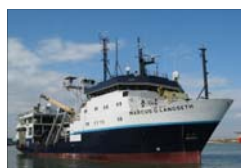
R/V Marcus G. Langseth