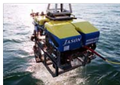
ROV Jason II