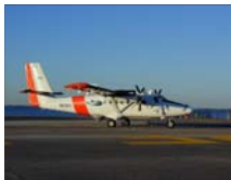
UV-18a 'Twin Otter'