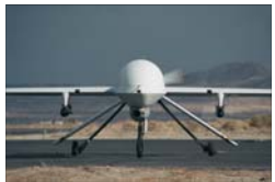
Altus ST UAV