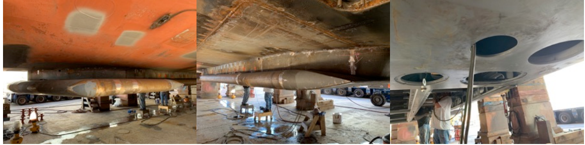
Gondola installed and welled to hull and being prepared for painting