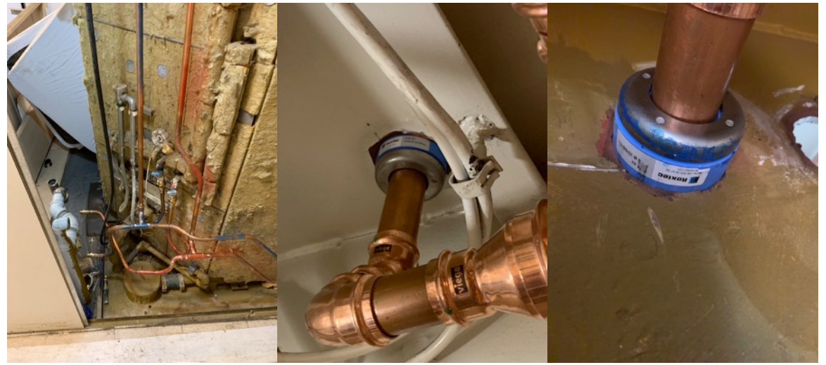
Shower piping work; New Roxtec fittings for piping pass thru deck and bulkheads