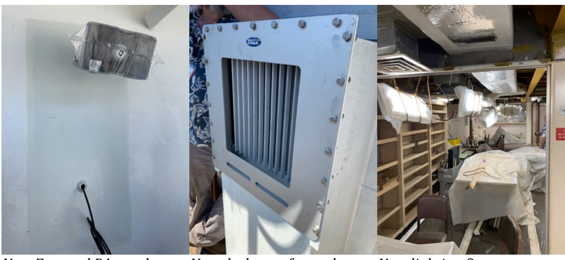
New External PA speaker;