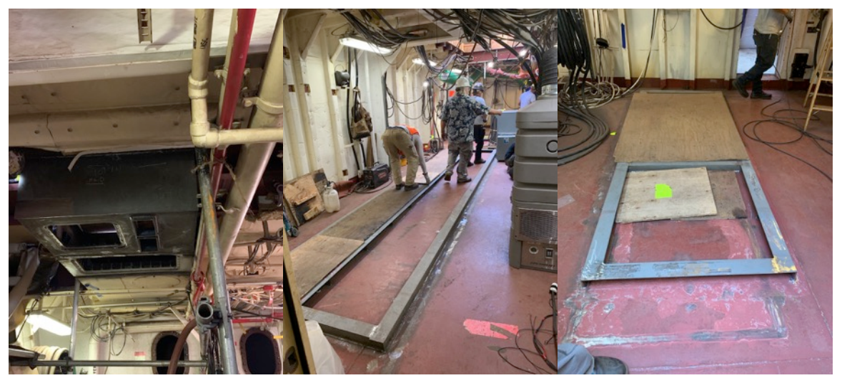
Riser boxes and foundations almost ready for installation of switchboards