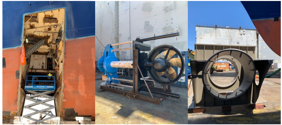
Opening for thruster being prepped, new thruster, new thruster hull insert