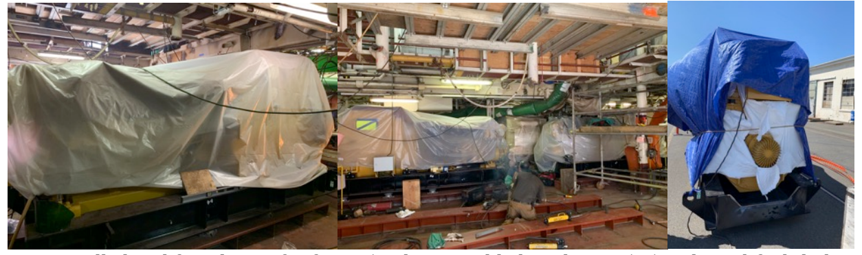
C32 installed and foundation for first 3516 being welded in place; 3515 with modified skid