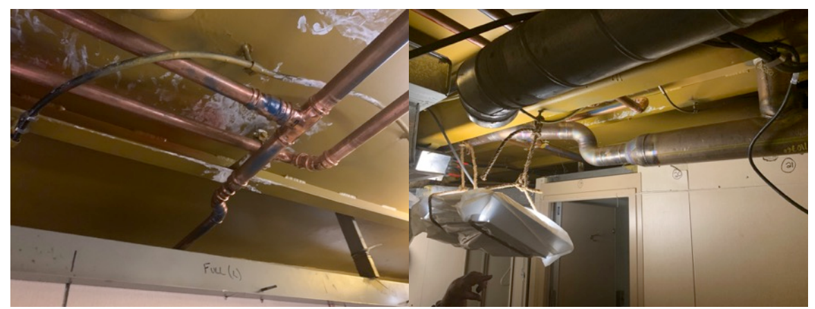
Potable water piping;