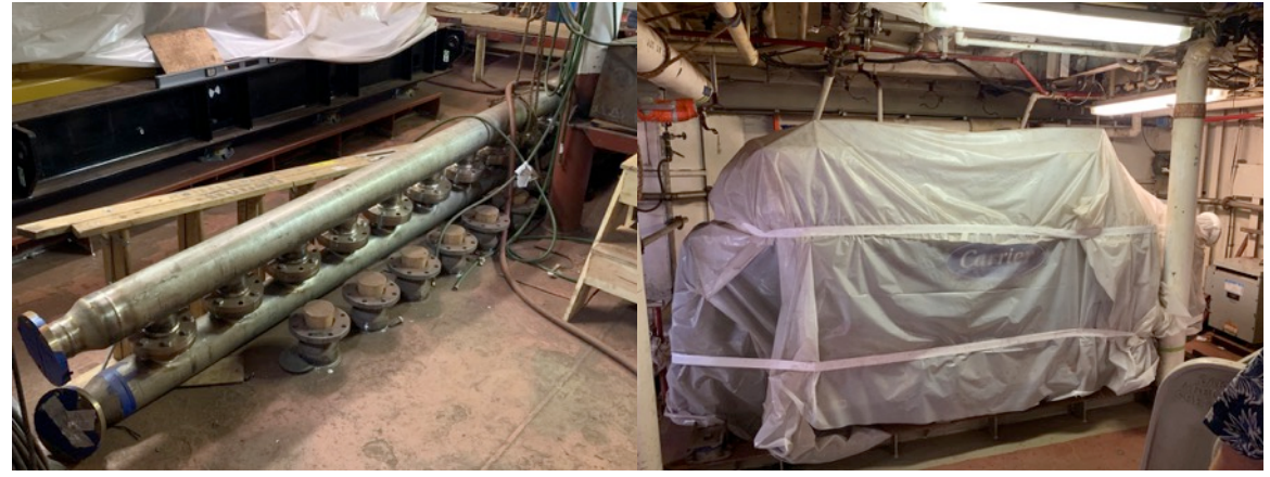
Ballast Manifold ready for installation;