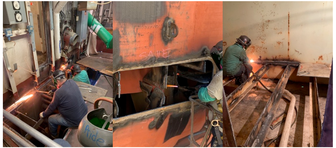
Steel Work in forward Starboard area of engineroom & in potable water tank