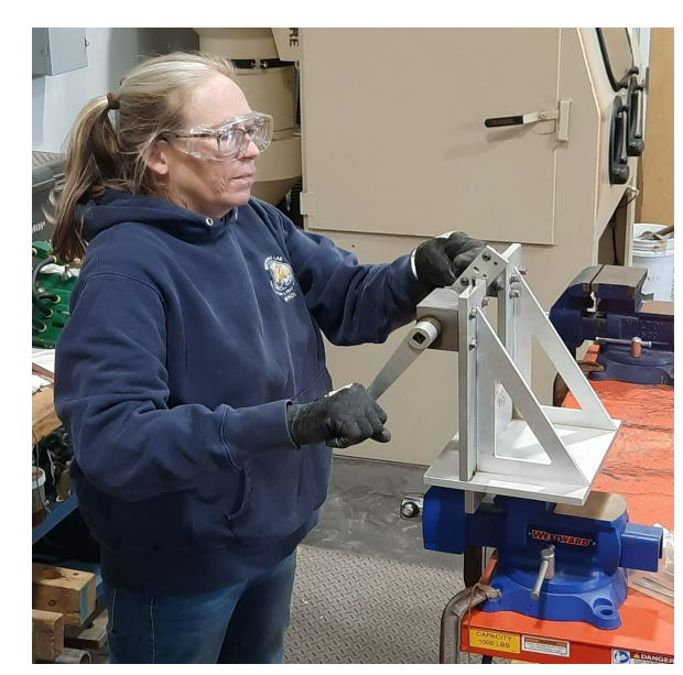
1/4", 3/8", 9/16" 3 x 19 Wire Rope Mandrel Wrap Test