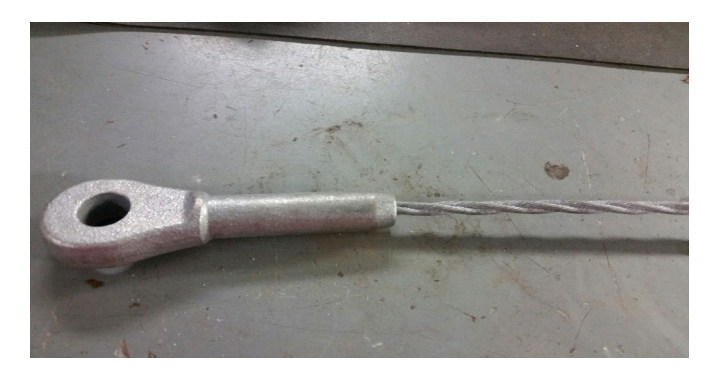
1/4" 3 x 19 Wire