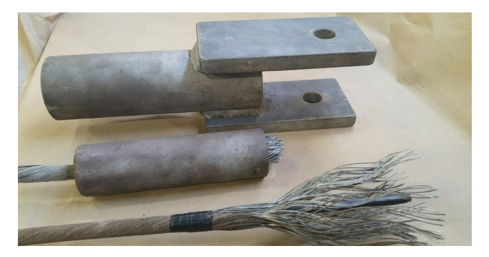
.680" & .681" Cable