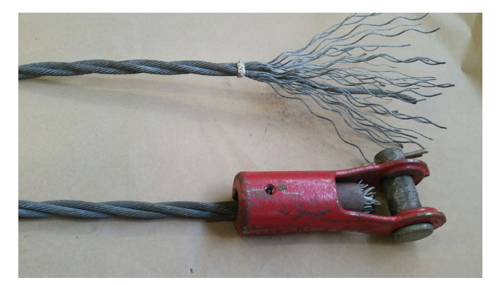
9/16" 3 x 19 Wire