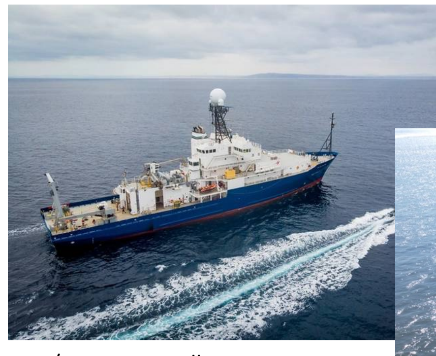
R/V Roger Revelle