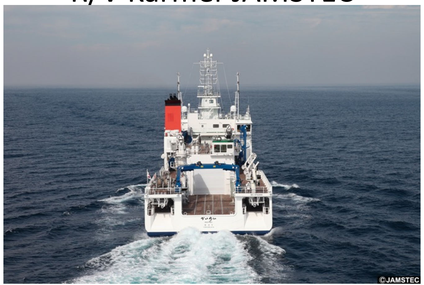
JAMSTEC's R/V Karmei – 100m vessel with 2D/3D seismic capabilities, coring, ROV support, 65 berths, 2016 build.