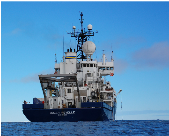
One of the current Global Class vessels, R/V Revelle

The UNOLS Fleet Improvement Committee (FIC) will host a Town Hall Session at the upcoming AGU Meeting to gather input on the science community's requirements for the next class of Global research vessels. Input from this meeting will help FIC write Science Mission Requirements (SMRs) that reflect the needs of the broad ocean science community. Early career to senior scientists should come to the meeting with experience-based ideas for a next-generation ship that will facilitate both discipline-specific and interdisciplinary research. The session will take place on Thursday, December 13th, 2018 from 6:15pm to 7:15pm at the Marriott Marquis, Independence Room F - H. Click here for more details!