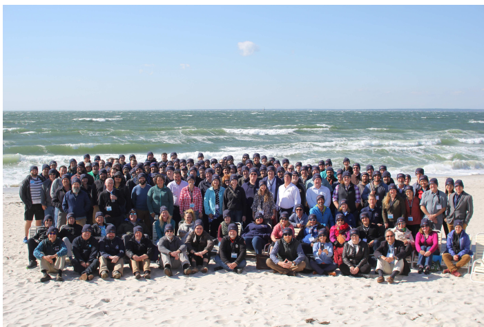
INMARTECH 2018 Participants in their knit hats.

The 2018 International Marine Technician (INMARTECH) Symposium saw record-breaking attendance from marine technicians around the world. The event was co-hosted by Woods Hole Oceanographic Institution (WHOI) and UNOLS and took place October 16 - 18 at the Sea Crest Beach Hotel in Falmouth, MA and WHOI.