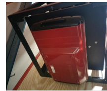
New multibeam EM2040P (NSF) Mounts in Keel Pod