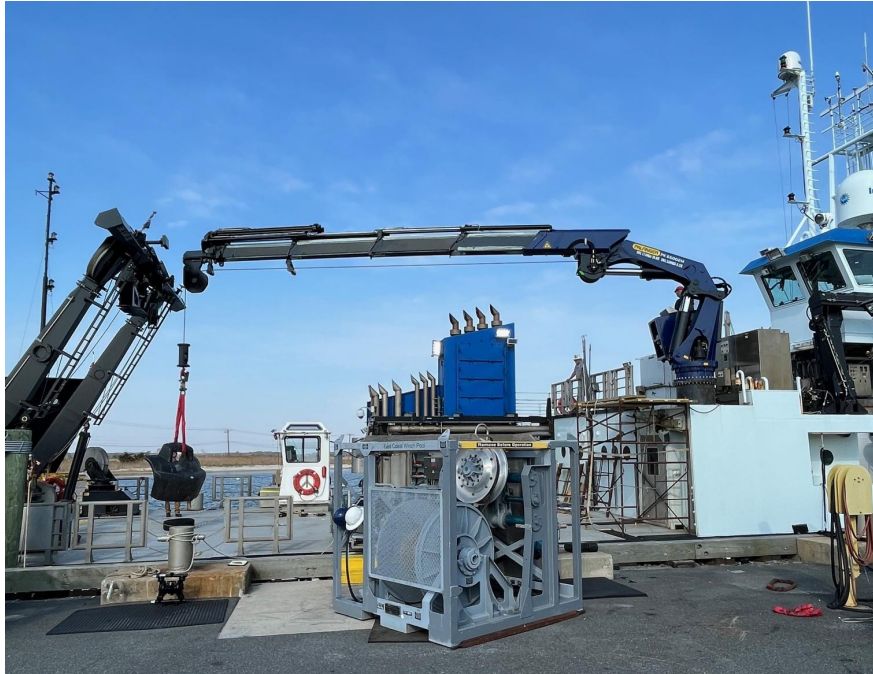
New main crane (NSF SSSE)