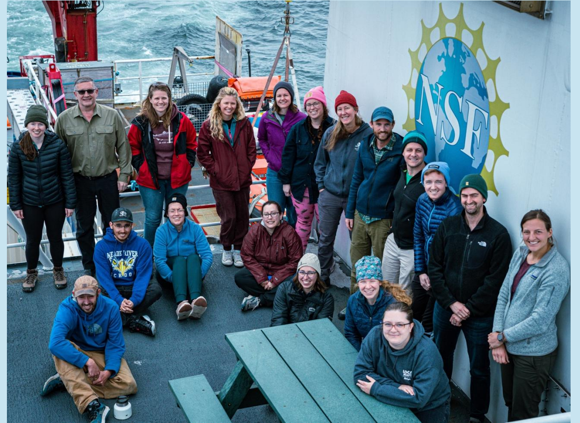
2023 Cohort on Sikuliaq