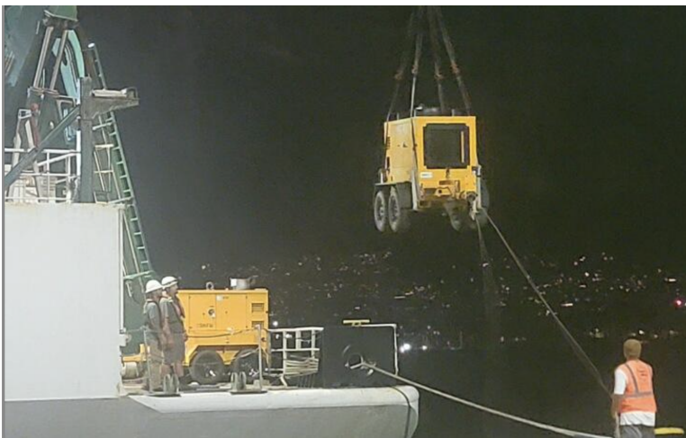
R/V KILO MOANA crew off-load generators at Kahului pier.