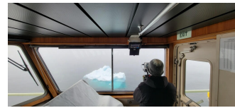
A view from the bridge of the R/V NEIL ARMSTRONG as it makes its way through the Arctic.