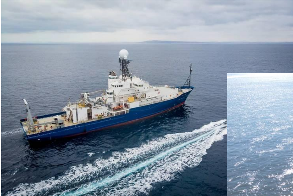
R/V Roger Revelle