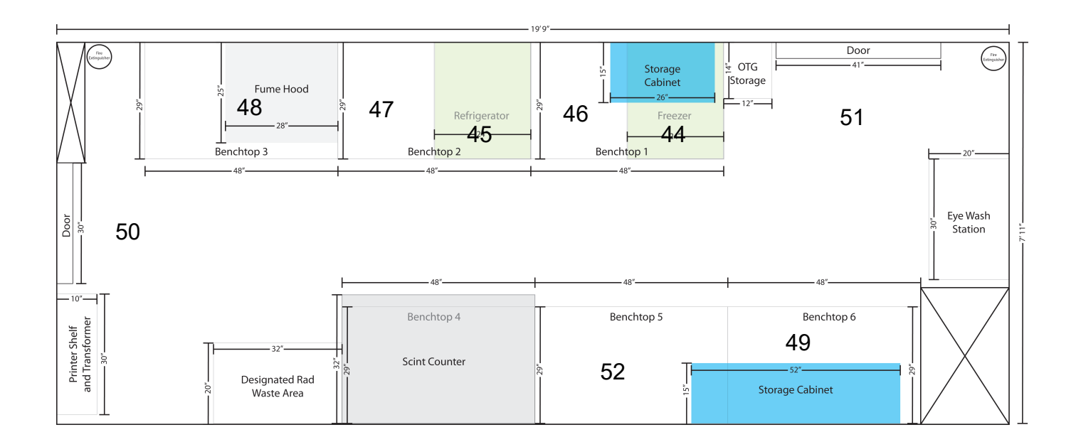
Figure #2 SWAB #1020 12 December 2021